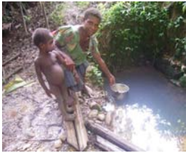
Water supply in village (Rawete)