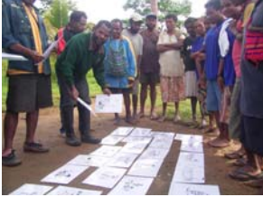
Health and Hygiene Participatory Education Program