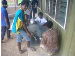
Rabbit Training Workshop in Ningal