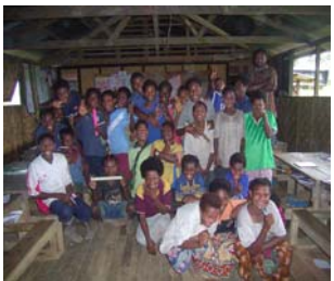
Students from Sibilanga Primary School

During 2007, TCA's education program focused on capacity building activities such as training the trainer programs.