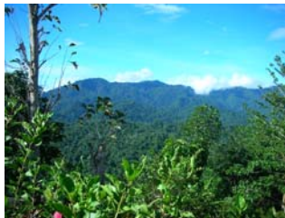
Mt Sapau - Torricelli Mountain Range (Sibilanga area)

The main objective of the Tenkile Conservation Alliance is to establish the Torricelli Mountain Range as a legislated Conservation Area to ensure the legal protection of the flora and fauna within this area.