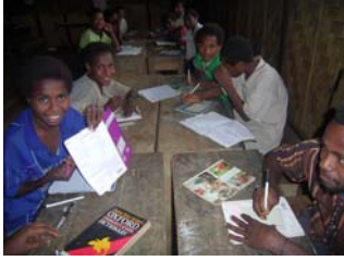
Students at Sibilanga Primary School