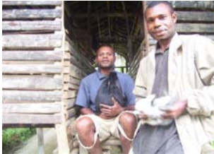
Successful rabbit farm - Wigote Village