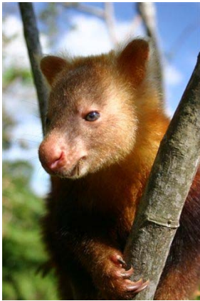
Weimang - Golden-mantled Tree Kangaroo