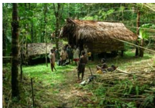
Research Hut - Waliapilk