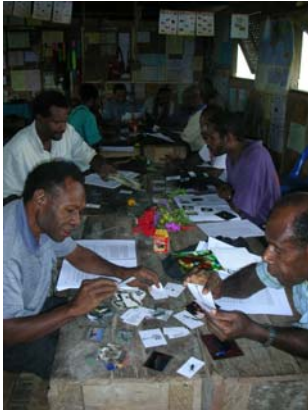
Teacher In-service Training - Sibilanga(Nuku)