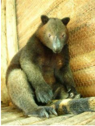
Tenkile—Scott's Tree Kangaroo