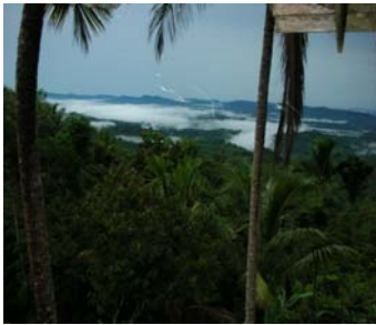
View of Torricelli Mountain Range from Sibilanga