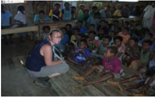
Capacity Building Officer at Sbilanga Primary School