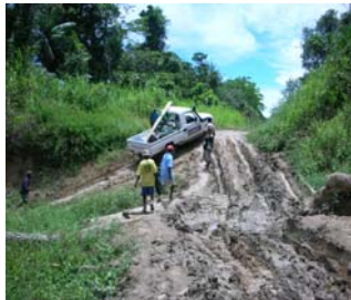
Road to Wewak