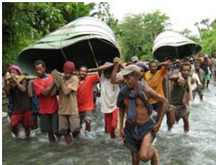
Transporting village water supplies (Wigote village)

The Tenkile Conservation Alliance (TCA) is a Non-Government Organisation (NGO); established in 2001. TCA communicates regularly with government bodies and has established relationships with the local level governments of the Aitape/Lumi and Nuku districts, Sandaun Provincial Government and the Department of Environment and Conservation.