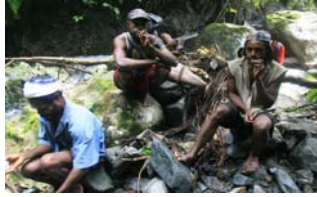
Walking to Distance Sampling site - Bibane