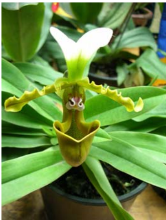
PNG Orchid Show