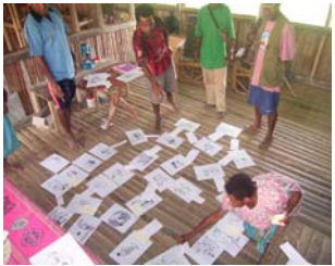
Facilitator and Project Officer Training