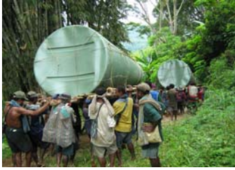
Carrying water tanks to Wigote Vilalge