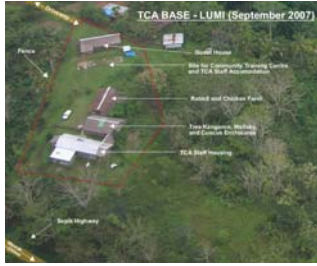
TCA Base Station Lumi