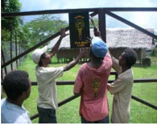
TCA Staff in Lumi