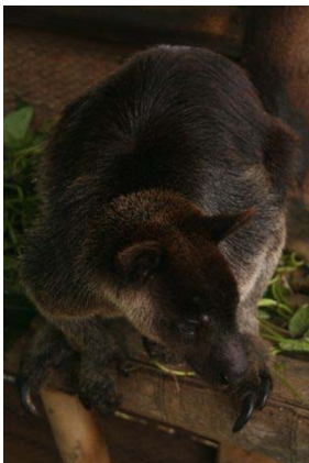
Yongi—Grizzled Tree Kangaroo