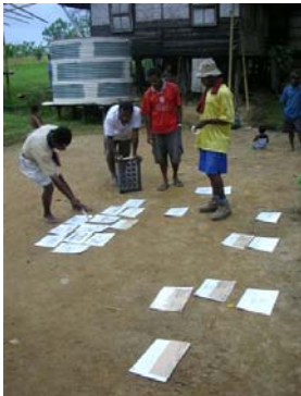
Participatory activities for establishing Community Protein Projects