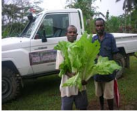
Cabbage Grown from Gardening Workshop