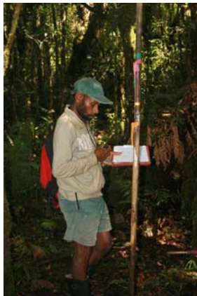
Distance Sampling Officer Training