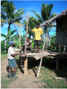
TCA Carpenters and Plumbers - Lumi