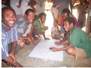
Community Mapping Workshops - Waunulu