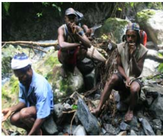
Field Research in the Torricelli Mountains