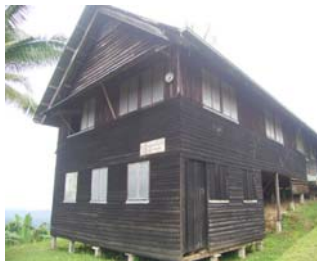
Sibilanga - CBC guesthouse